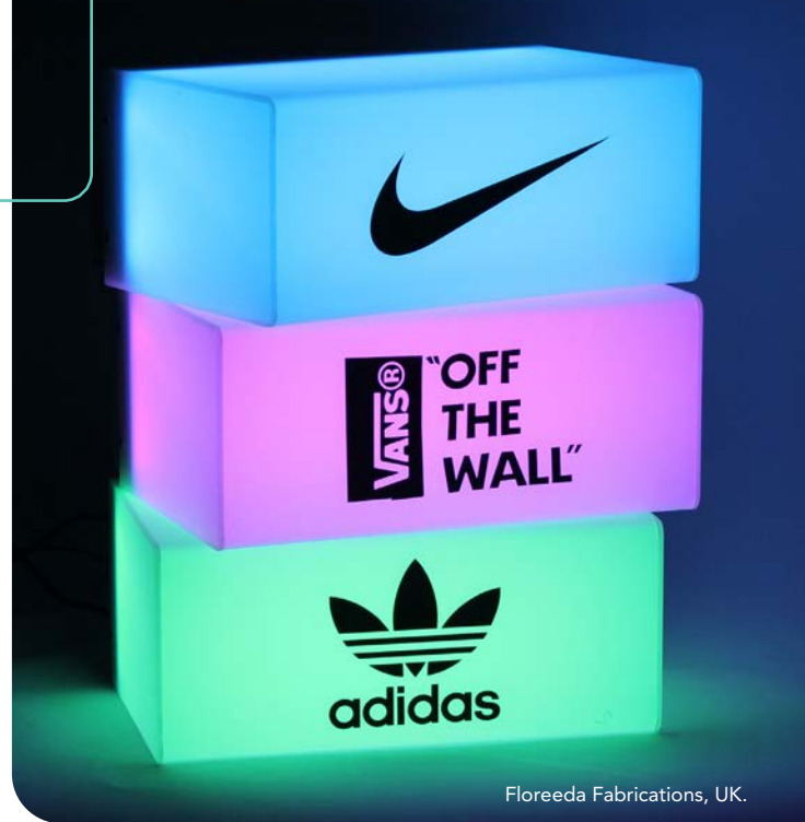
Floreeda Fabrications, UK.

In addition, its excellent colour correlation at different wavelengths means it can be used with LEDs, from warm white through to natural daylight, with confidence of achieving the output colour temperature required.