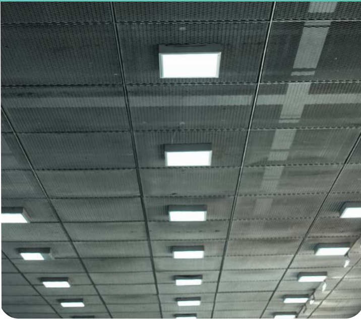
Back Lit Panel:

The extensive range of grades, light transmissions and thicknesses provides ultimate flexibility, no matter what the luminaire design construction.