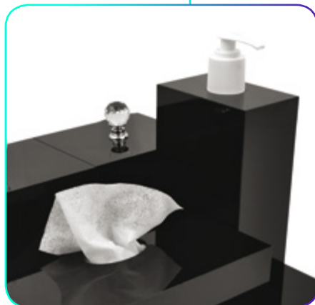
Cosmetic POS display by GBL Associates